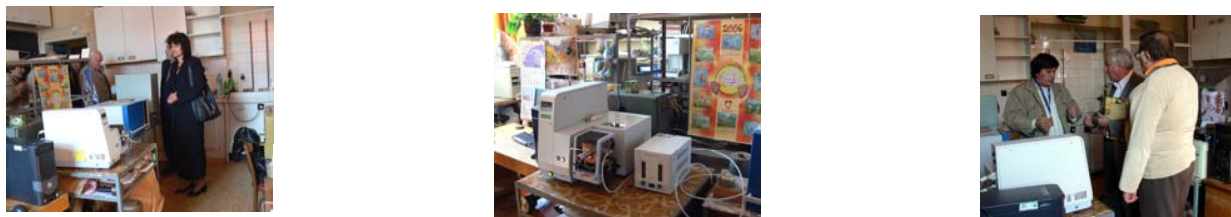
Getting Acquainted with the upgraded Differential Scanning Calorimetry equipment