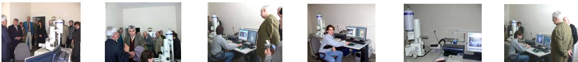
Visit at the Electron Microscopy Laboratory – demonstration of capabilities and advantages of the Scanning EM JEOL 6390 with the Energy Dispersive Spectroscopy INCA system