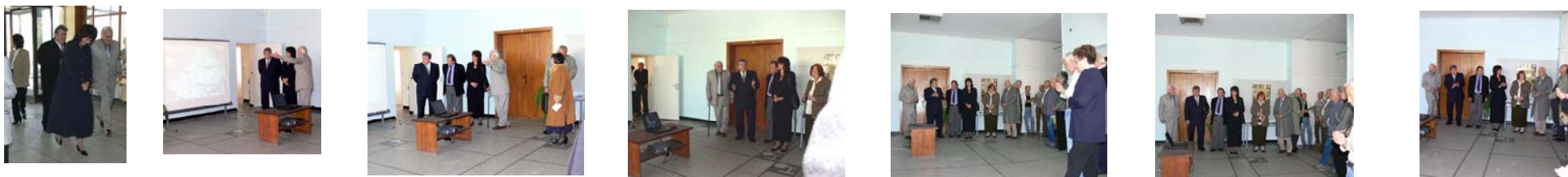
Welcoming the visitors from the Ministry of Education and Science and Bulgarian Academy of Sciences Institutes